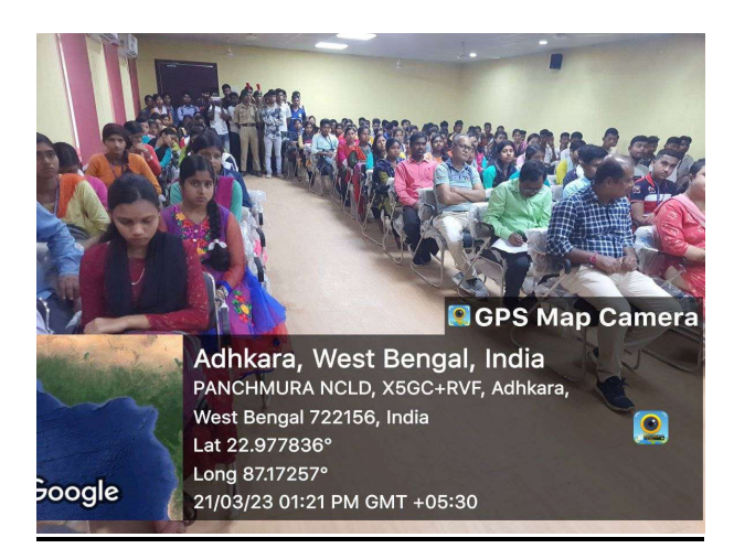
Participants listening with attention to keynote talks